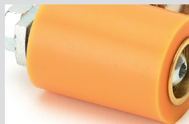
Highest quality of silicone for longlife