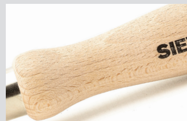
Unpainted handle for good grip and easy cleaning